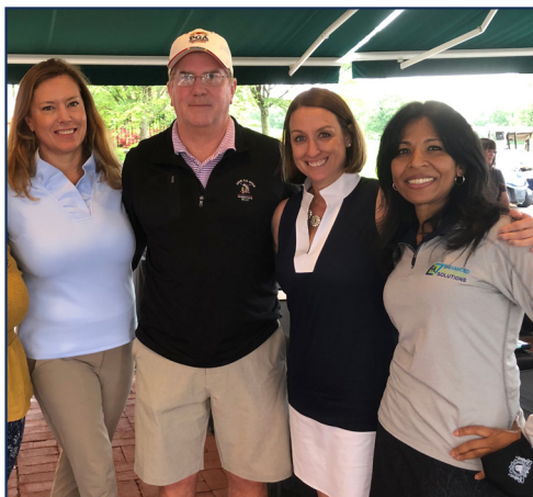
Long-time lead sponsor: AJ McAllister '80 & McAllister Towing & Transportation.

(Twosome Package and Single Golf Reservations on the following page.)